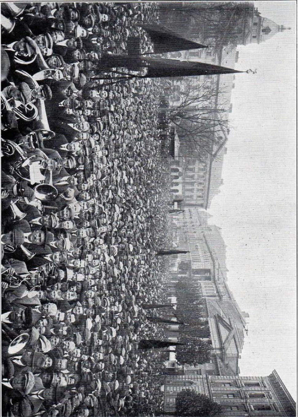
Mass Demonstration of Polish Workers on 1st of May, 1925.